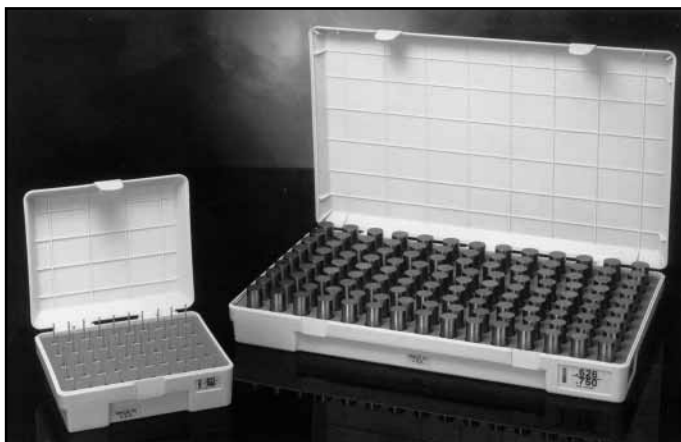
METRIC GAGE SETS